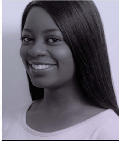
EFFIE ASAFU-ADJAYE BOARD OBSERVERSHIP PROGRAM